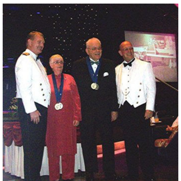
remember this special Mariner's Appreciation evening.